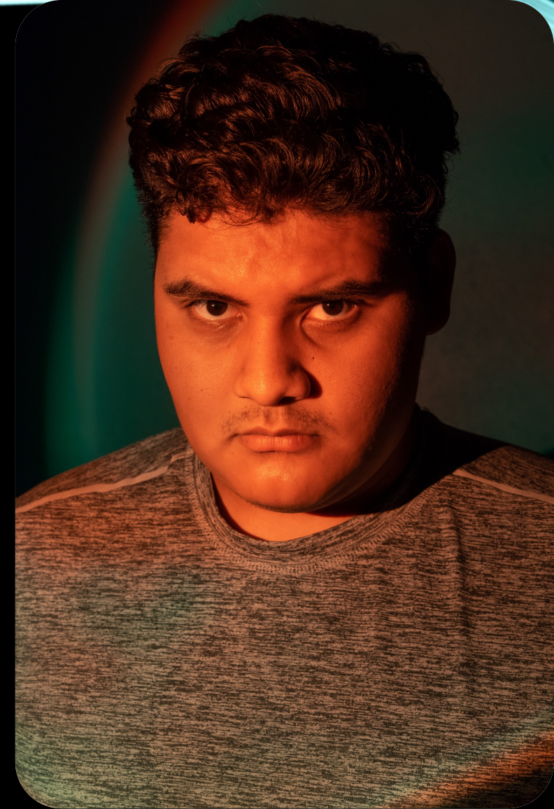
High aperture (8.0f)