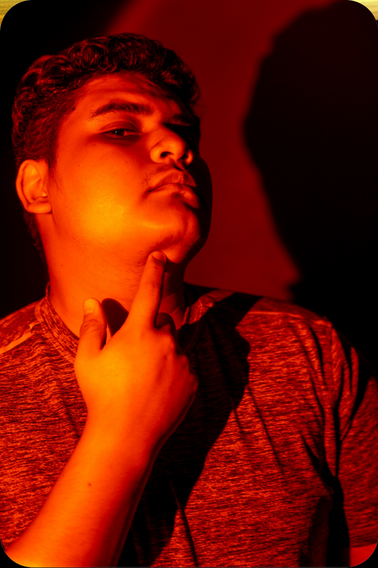
Low ISO (100)