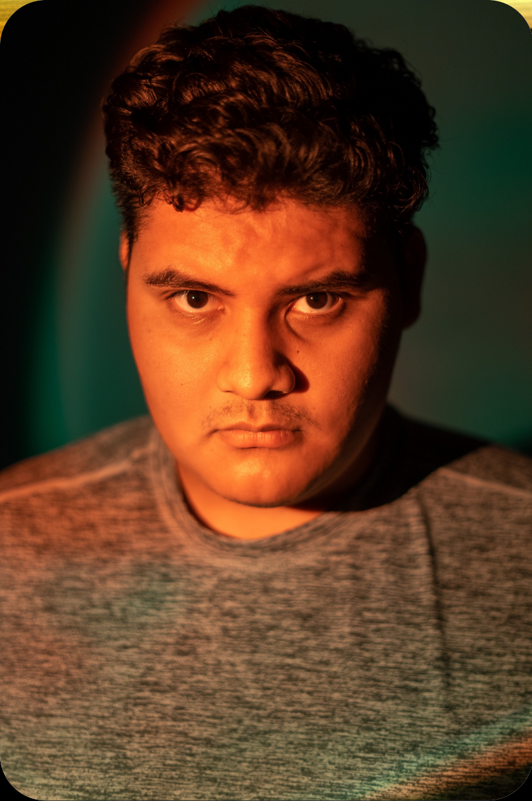
Low Aperture (1.8f)