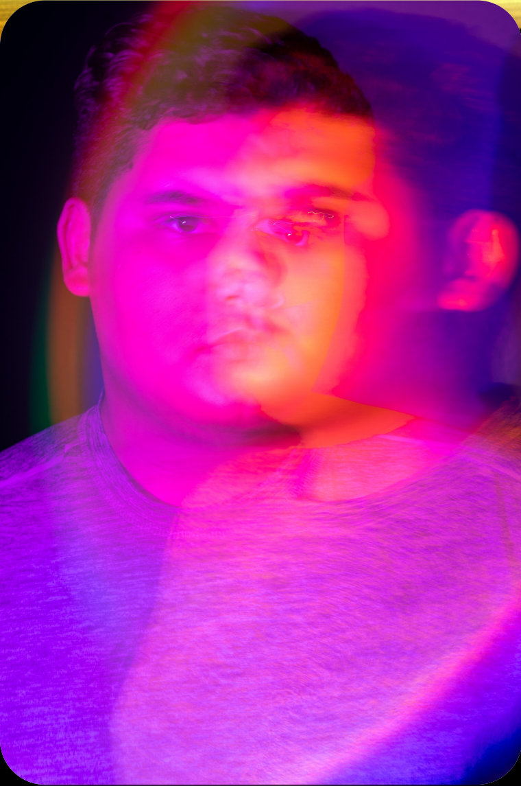
Low Shutter Speed (4sec.)