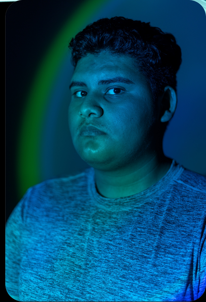
High Shutter Speed 1/160 sec